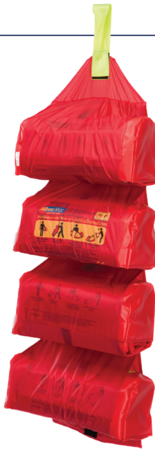
ALBHLD03 Holds four standard or large mats