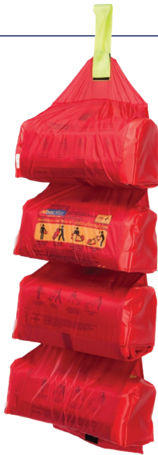
ALBHLD03 Holds four standard or large mats